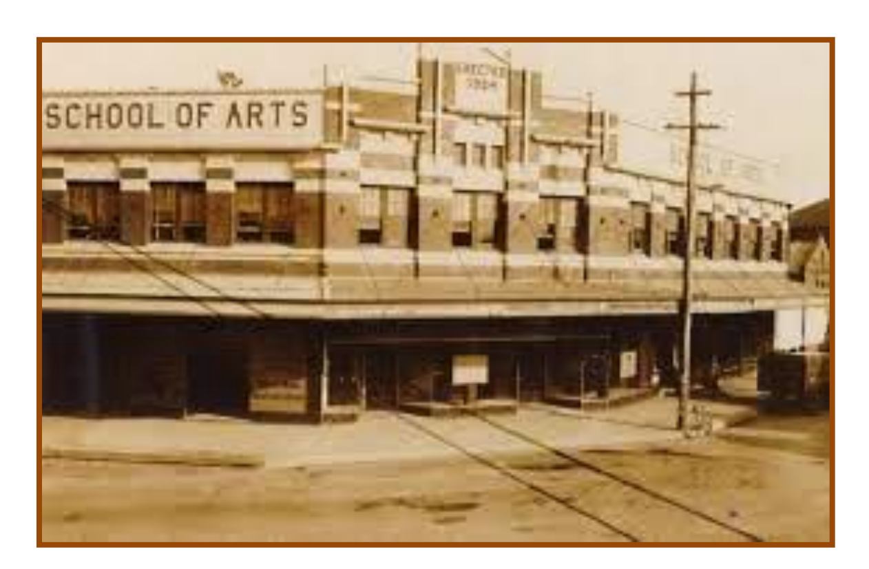
The 'palatial' new building 1924

was occupied by Messiters (mercers) and another shop was occupied by the Niagara Cafe. The entrance to the School of Arts building was thought to be very impressive. The doorway was recessed and the walls of the doorway decorated with blue glazed tiles. The foundation stones which had been laid about 6 months prior were prominently placed either side of the entrance. The door to the building was quite imposing and highlighted with overhead lights either side. A vestibule 10 feet wide contained a staircase with elaborate balustrades and turned handrails which had been proudly manufactured locally. The upper floor which was approached from Vincent Street was divided into a reading room and recreation room each 28 by 24 feet and the billiards room measuring 60 by 42 feet had accommodation for six tables. Most of the rooms on the first floor featured glass double windows giving an "abundance of air and light" There was also a hallway and an office 13 by 10 feet and other conveniences, making the building: "one of the most complete of its kind in this part of the world".