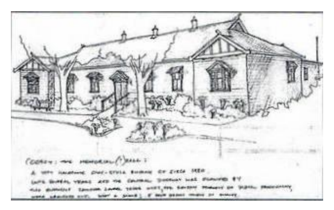
This drawing courtesy of Sunshine Coast Regional Council