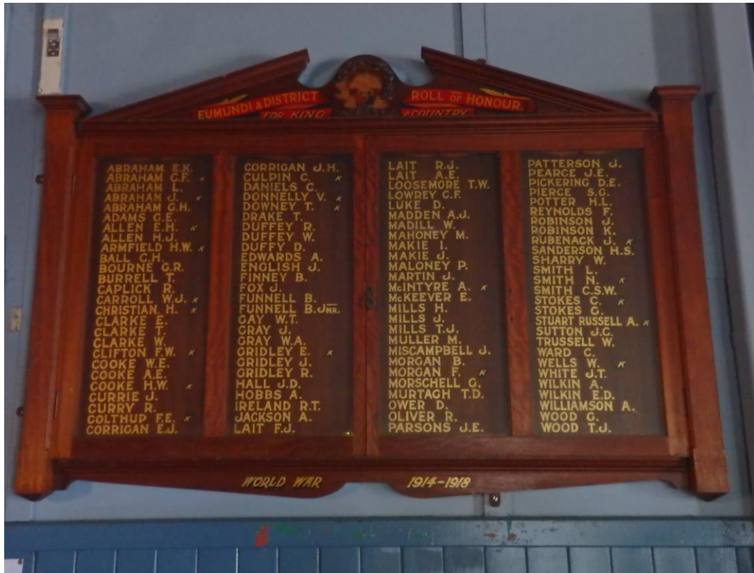
Updated Roll of Honour in the School of Arts Hall 2015