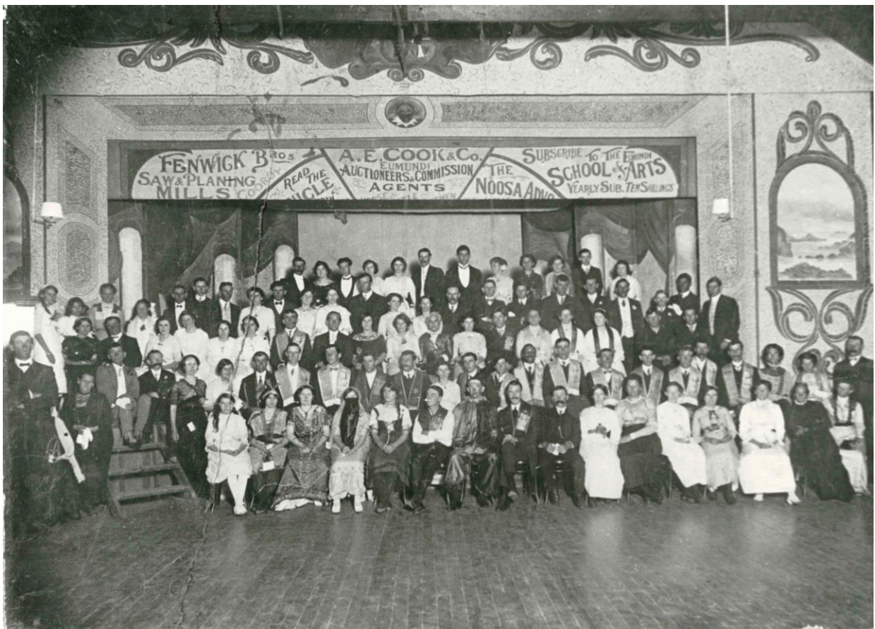
Fancy Dress Benefits Ball 1920

In September 1920 a Fancy Dress Ball was sponsored by the Ladies Benefit Committee. The object of the Ball was to assist in reducing the debt on the Hall.