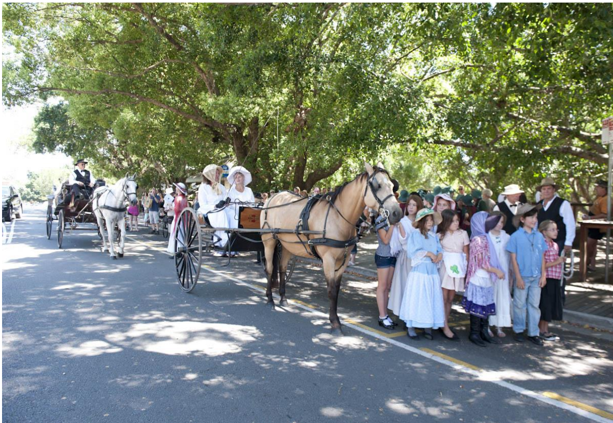
Procession Memorial Drive 2012

To celebrate the Centenary of the Hall in 2012, a re-enactment of the 1912 opening ceremony was organised. This included a procession down part of Memorial Drive, the main street, and a theatre style re-enactment of the opening ceremony, followed by a Ball where the profits went towards the ongoing maintenance of the building. The event captured the essence of 1912.