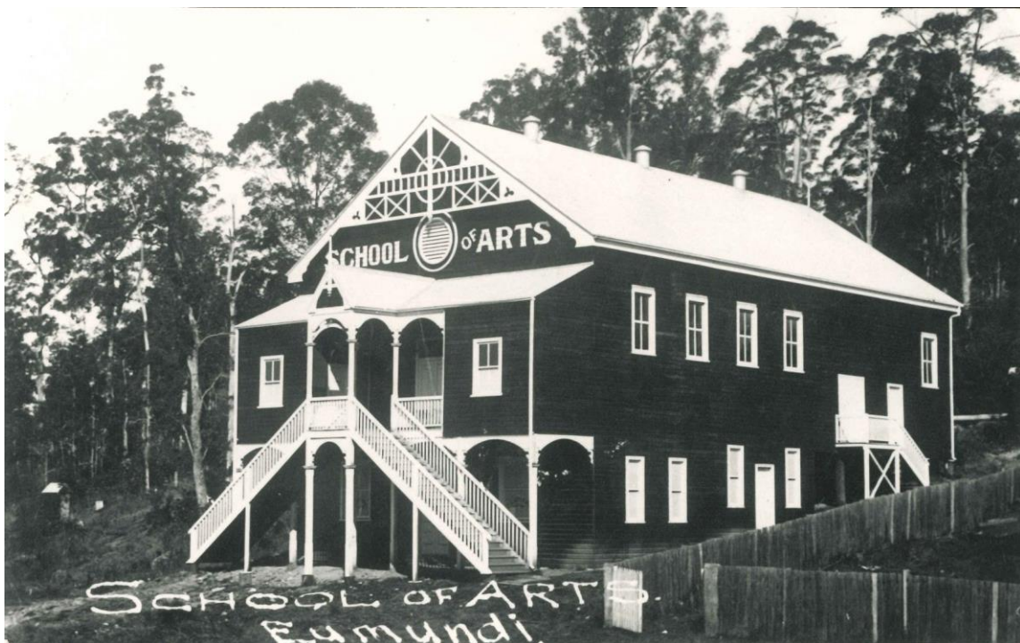
Circa 1914

The School of Arts is fast assuming form – the contractor, Mr W Bytheway, has all the framework erected ready for the boarding, and the roof and the building is expected to be finished in six weeks time. The committee are to meet shortly to decide what course should be taken to make the opening worthy of Eumundi and its residents. The total cost of the building is expected to reach £1,000 (pounds).