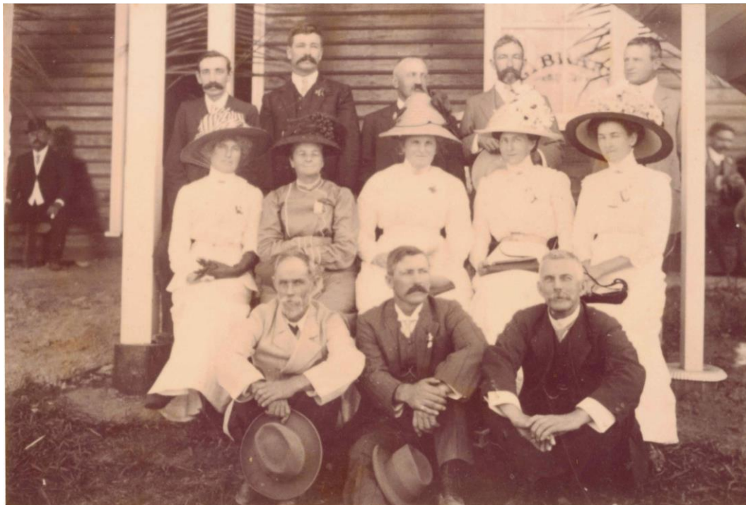
Committee of the School of Arts (presumed) 1912

Small changes were constantly being introduced to the hall to encourage more use, some of which were implemented and some were not. The electricity service was available in Eumundi in 1939, however the hall did not have the power connected until 1941.