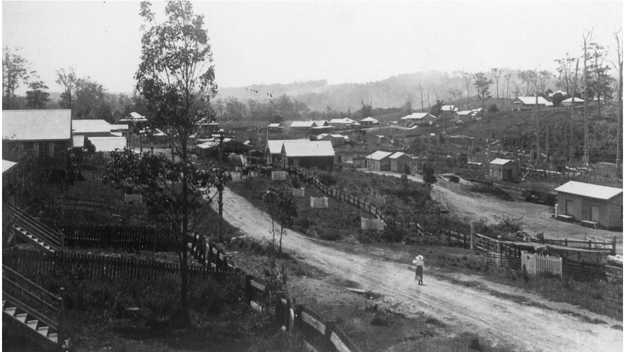
The young Memorial trees, each fenced for protection, line the main thoroughfare of the town ca 1920