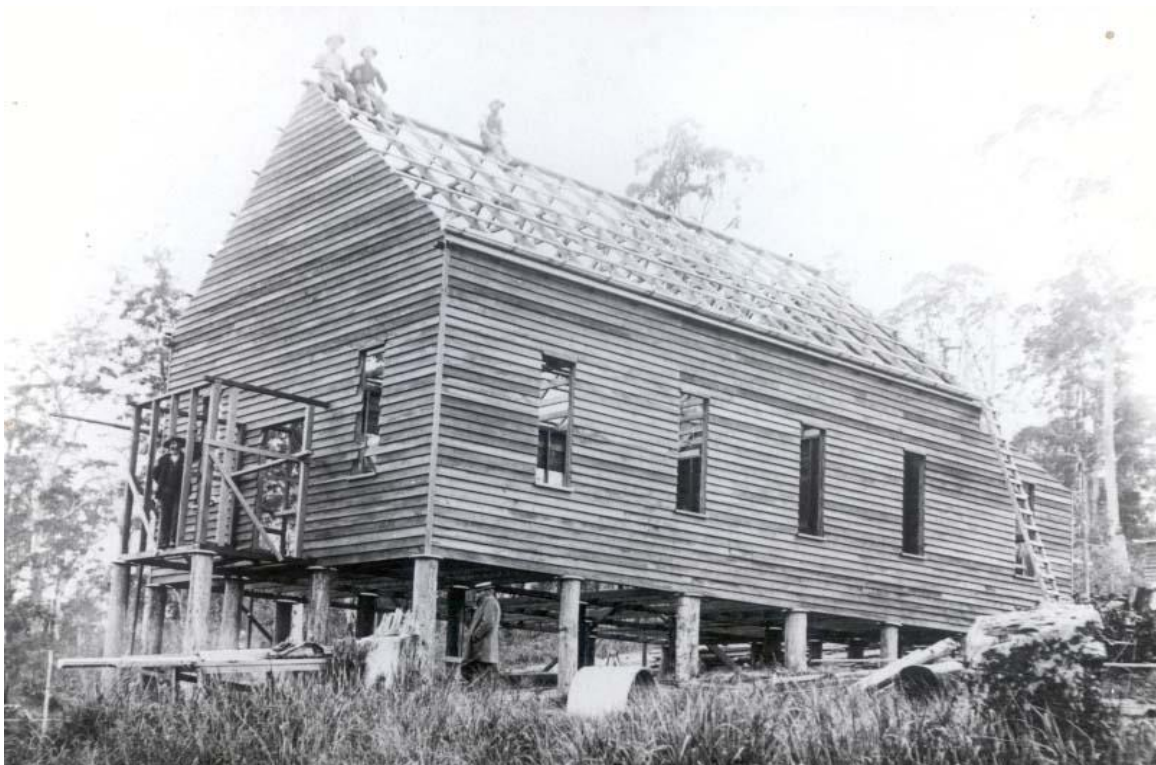
Construction of the first hall circa 1908

Community functions were held in a barn on a property owned by E H Arundell until the first School of Arts Hall was built on the reserve land in 1908, in a style similar to many public buildings built in Eumundi during its early settlement. The Methodist Church, circa 1911, the Church of England, circa 1912, and the Masonic Hall, circa 1923, are all examples of this type of vernacular timber construction. The early 1900s was a boom time for Eumundi with settlers migrating north from the Northern Rivers area of New South Wales to take up the rich grazing and farming land available here. By the time of the 1911 census, the population of the town had risen to 446.