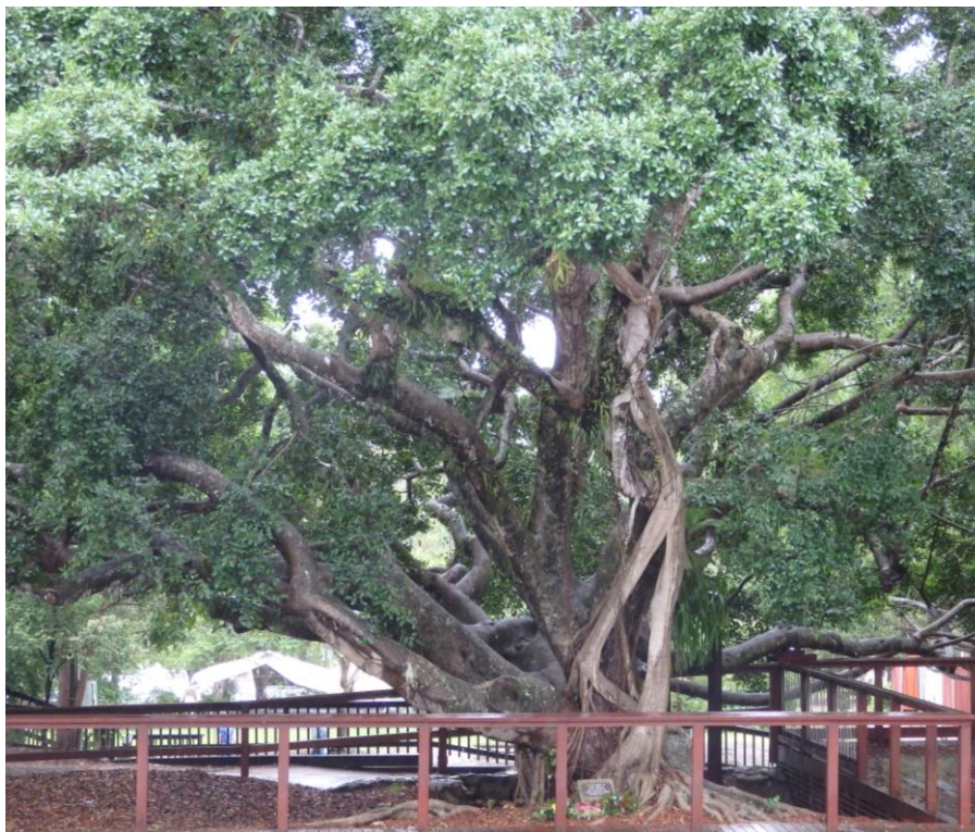
Original Memorial Tree c 2015

The photograph shows the bronze plaque at the base of the tree, slightly to right of centre. Memorial wreaths are laid at the base of the plaque