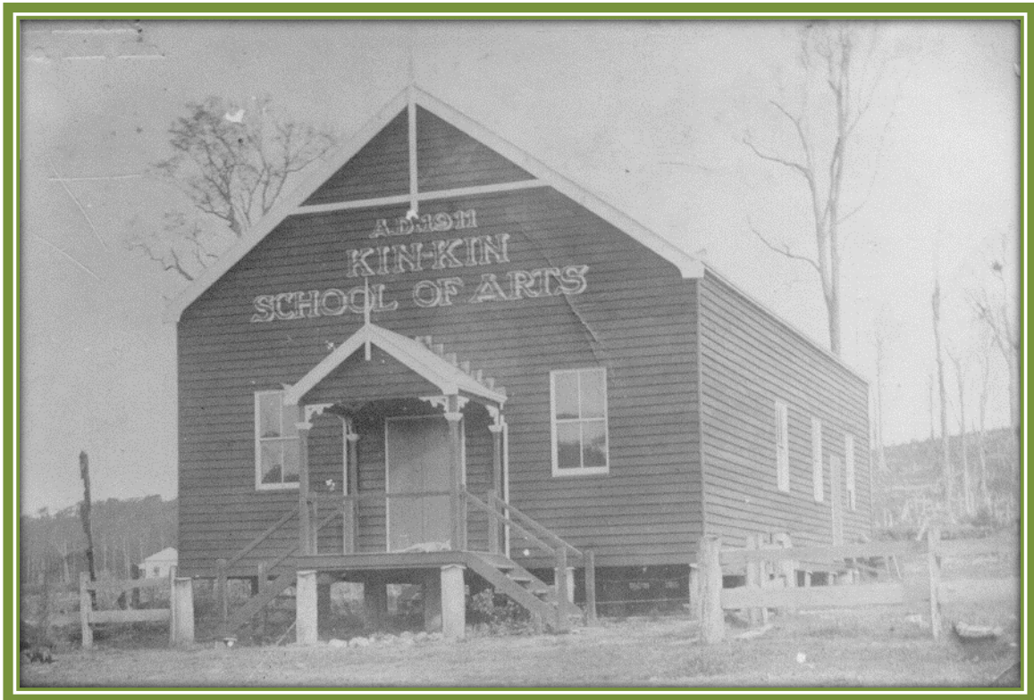
Kin Kin School of Arts 1911

As seen in the photograph of 1911 below, the hall was originally built on low blocks but was blown off by a cyclonic storm in 1924. Tenders were called and it was quickly rebuilt.