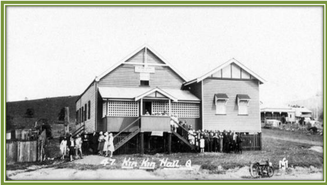
School of Arts with Extensions - circa 1920's