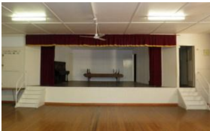
Main Hall Stage April 2013

The Pomona School of Arts building has historical significance as a focus of social and organisational activities in the area since 1927.