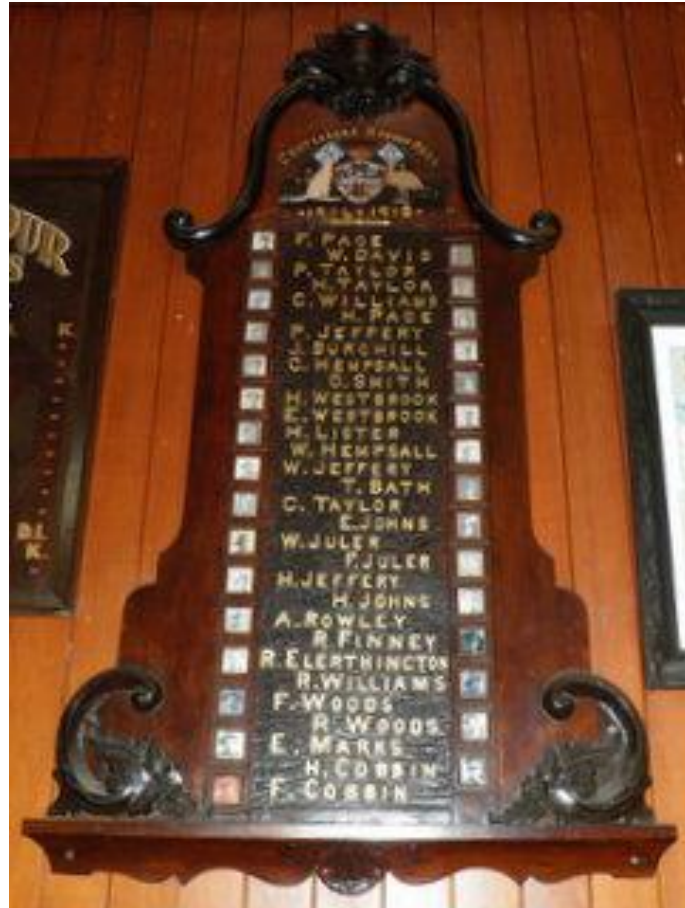
Honour Board 1914-18 War Cootharba District

The Pomona School of Arts building has historical significance as a focus of social and organisational activities in the area since 1927.