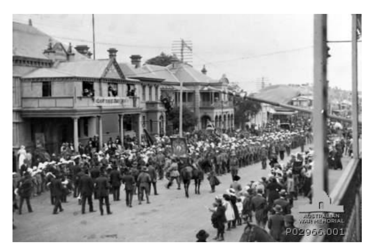
Recruiting march in Yass en route from Wagga Wagga, where the march started in December 1915, to Sydney. The Mechanics' Institute is on the left: the kangaroo statues can be seen above the Balcony Room, from which is hanging a banner reading 'God Save the King'.

The Yass branch of the Red Cross – the third branch to be opened in New South Wales after those in Sydney and Newcastle – held its official opening in the Institute's Balcony Room in 1914. The Institute was frequently used during the First World War to raise funds for the troops overseas. In December 1915 the building hosted a welcome home for wounded soldiers from the district. And the first ANZAC Day ceremony in Yass was held at the Institute in 1916 (an outdoors event had been planned but the weather forced it indoors). In 1919, the building was used as a vaccination centre during the influenza epidemic that swept the world at the end of the First World War.