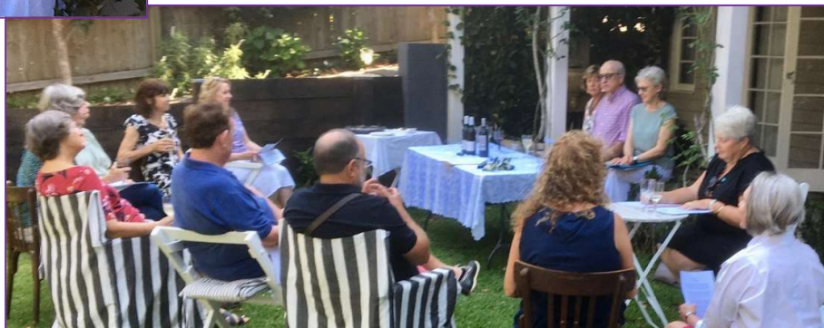
Right: A garden setting provided a wonderful casual atmosphere for those who attended the AGM.