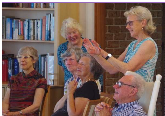
An appreciative audience