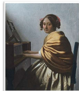
Young Woman seated at a Virginal Vermeer, c.1670

Tickets to this exhibition are timed entry only; we recommend booking as soon as possible to. As tickets are timed entry only, it would be a good idea to pre-purchase through Ticketek to secure your preferred session. Tickets purchased on site are subject to availability on the day.