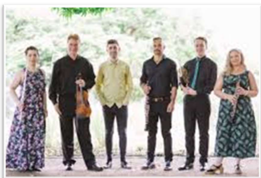
Members of the Southern Cross Soloists

The official launch of the Bangalow Music Festival is in mid-April. Early Bird Tickets are available until Friday 16th April, and can be purchased at: https://www.stickytickets.com.au/o5vvu/bangalow_music_festival_2021/buy-tickets .