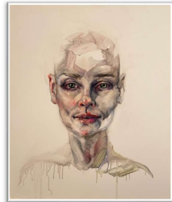
'I'm Here' by Dee Smart