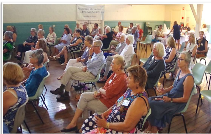
Members enjoying our first virtual lecture

ADFAS Byron is committed to ensuring a full program is delivered during 2021. If border restrictions prevent a lecturer travelling at the scheduled time, members will be provided with a virtual link to view the lecture at home.