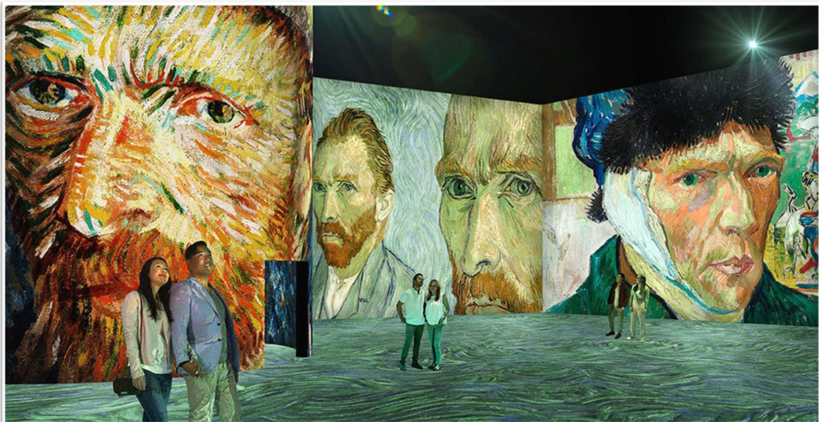
Van Gogh at The Lume

The inaugural experience will feature the works Vincent van Gogh. Visitors will be able to digitally enter his masterpieces as they accompany the artist on his journey through the Netherlands and France. They will have several dining options inspired by the cuisines of those countries, and a gift shop from which to purchase the perfect souvenir.