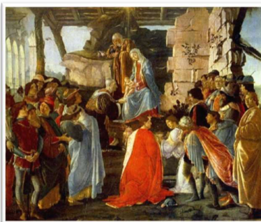
Adoration of the Magi Botticelli, 1475

This exhibition, organised by The National Gallery, London, Art Exhibitions Australia and the National Gallery of Australia, will be on display in Canberra from 5 March to 14 June 2021. Through 61 paintings, the exhibition spans 450 years and explores the story of Western European art through seven defining periods, from Italian Renaissance painting to the rise of modern art.