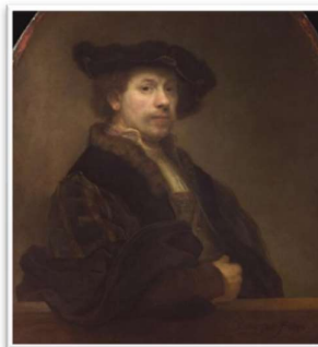
Self Portrait at the Age of 34 Rembrandt, 1640