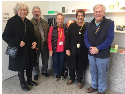
At the Lyon House Gallery