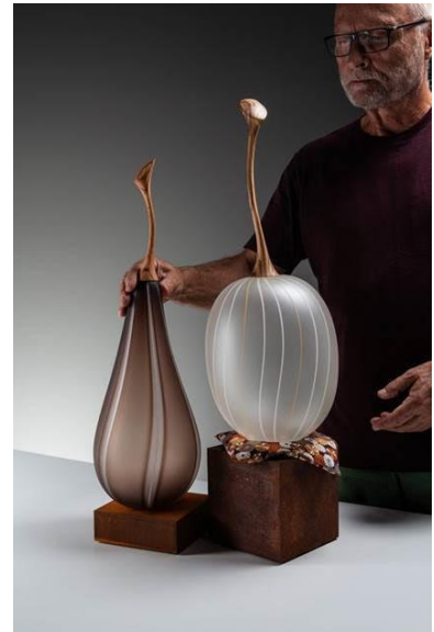
(Above: Pear and Plum, Nick Mount)

In this talk Grace will give us a comprehensive overview of the development of studio glass in Australia illustrated with examples of studio glass from around the country.