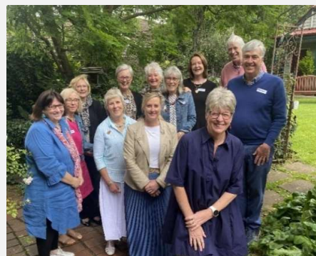
Committee luncheon December 2022