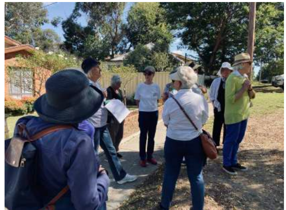
The Happy Wanderers. ADFAS MP members take a historical walk around Queanbeyan, admiring lovely buildings and braving the suspension bridge.