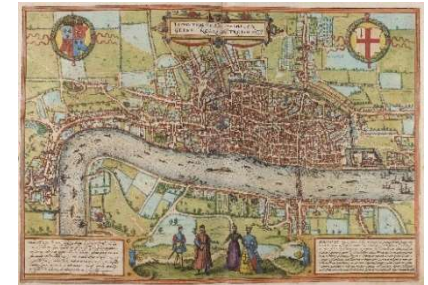
Map of London, 1572

This lecture looks at some of these and how many can be traced to the City of London.