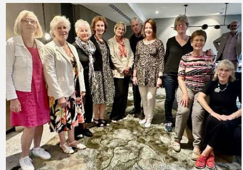
Committee EOY luncheon December 2023