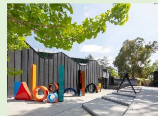
HEIDE MUSEUM OF MODERN ART