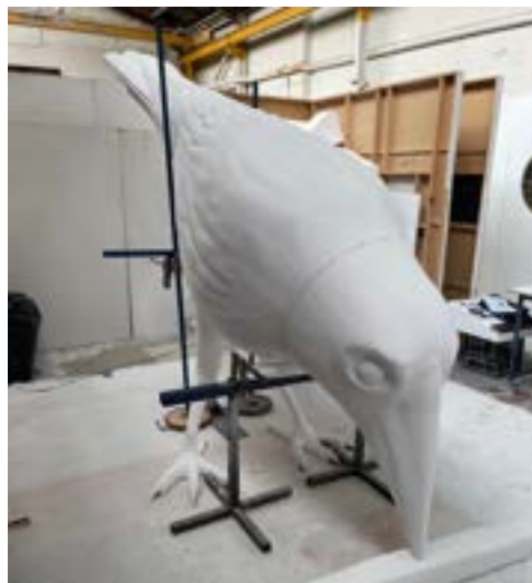
The magpie sculpture was finished in Sydney.

“Everyone’s happy and excited to see Big Swoop back and people are making trips to the city just to see it.”