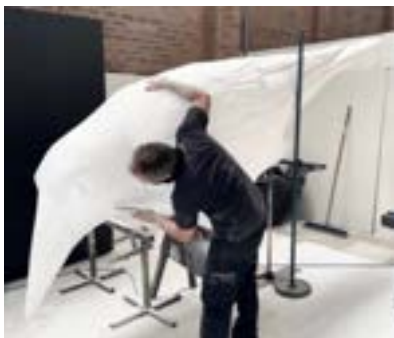
Realism is the aim