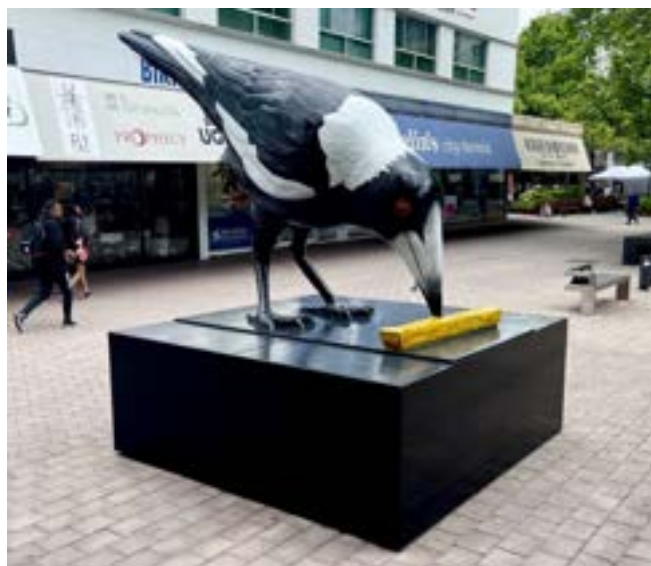
Big Swoop is back bigger and stronger than ever.

The repairs involved rebuilding the sculpture with eight millimetre fibreglass designed to last for many decades. A