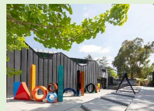
HEIDE MUSEUM OF MODERN ART