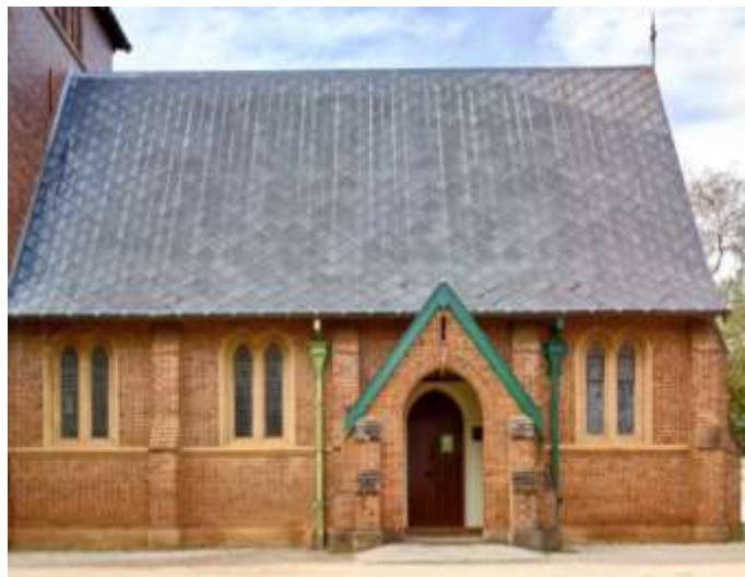
The nave church completed in 1876