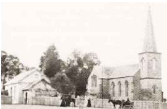
An early image of the Heber Chapel and St Paul's Church

The CR group met monthly (except for the cold winter months) for the next two years or more as they worked their way through every detail of first the Church and then the Chapel, recording every item of significance (and no doubt,