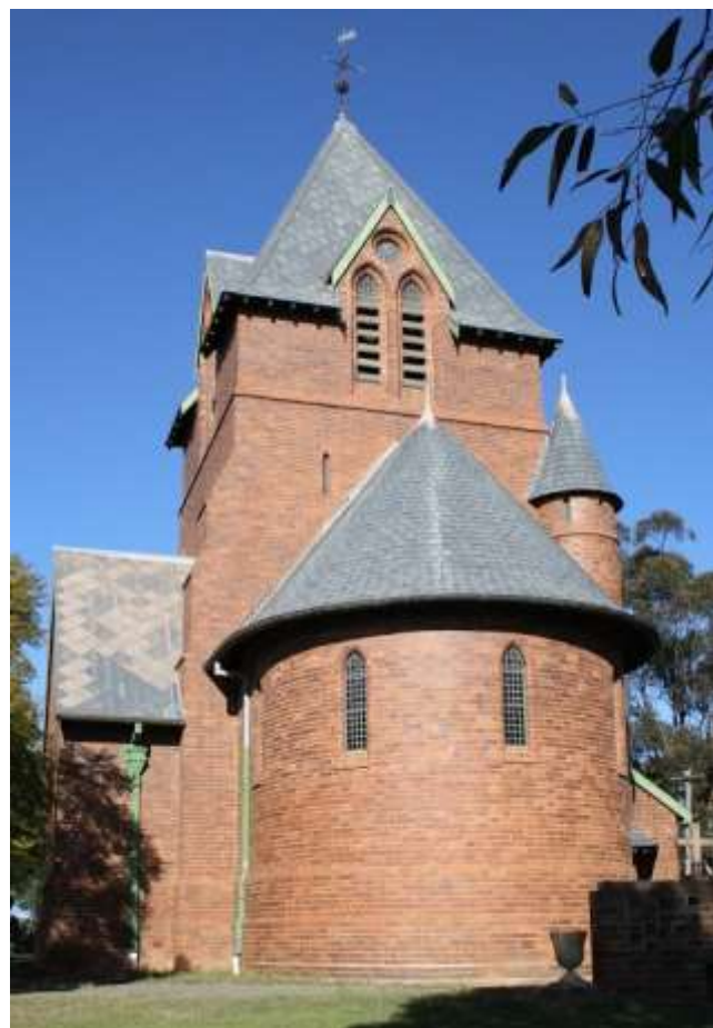
The rather spectacular extensions to the north of the nave, completed in 1898

These rather beautiful extensions exhibit a high level of design and workmanship. The square bell tower, which sits above the choir, is capped with a pyramid shaped roof, at the apex of which is a weather vane rather than a cross. The ringing chamber is reached by a 42-step narrow spiral stone staircase in a circular tower which has a steep conical roof. The belfry, which originally housed a single bell, now houses a peal of eight bells, and therein lies another story. The original bell has been retired and is now stored in the ringing chamber, along with its ringing mechanism. The roof of the semicircular apse is semi-conical and replacement of the roof tiles some years ago revealed the helical arrangement of the timberwork beneath.