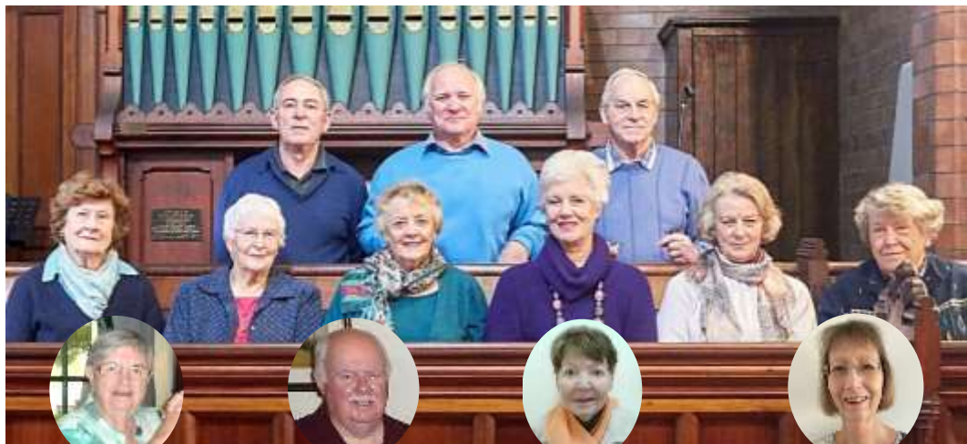
Church Recording Group, St James Menangle

The recording exercise along the same lines as for St Paul’s Cobbitty was completed as a printed and bound 167 page full colour illustrated volume in June 2017.