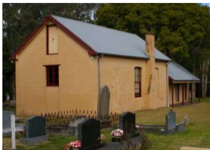
The Heber Chapel today

The rather humble Heber Chapel , named after the Bishop of Calcutta in whose See Cobbitty was located at the time, has served many purposes since it was built in 1827 by Thomas Hassall, the 'Gallop- ing Parson'. Its current function was as a meeting place for various church groups and activities but it had also been set up as a museum housing many