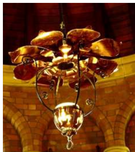
Copper & brass sanctuary lamp