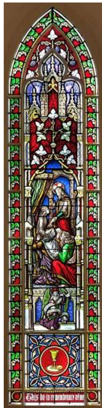
The Warrington Window

items of historic interest, such as religious and secular books, many dating back to the early years when the Chapel was the first and for a time, only religious and educational centre south of Liverpool. It also contained a collection of paintings and photographs and other documents of historical interest, and rather surprisingly to many of the group, provided a number of instances of architectural influences from India.