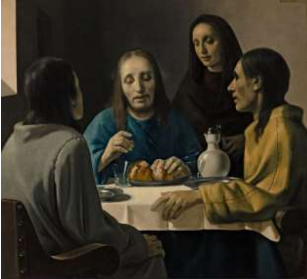
Vermeer's 'The Supper at Emmaus' – or is it?