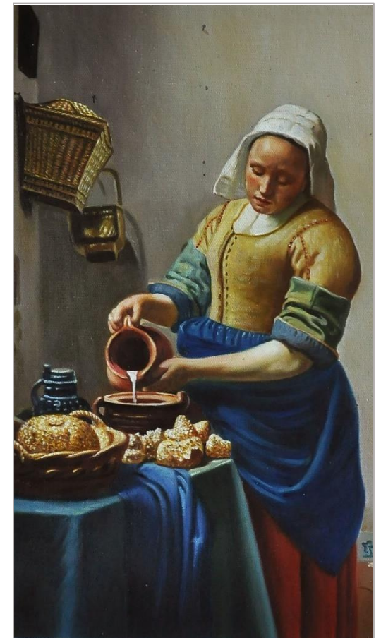
The Milkmaid, c.1660, Johannes Vermeer, Rijksmuseum, Amsterdam