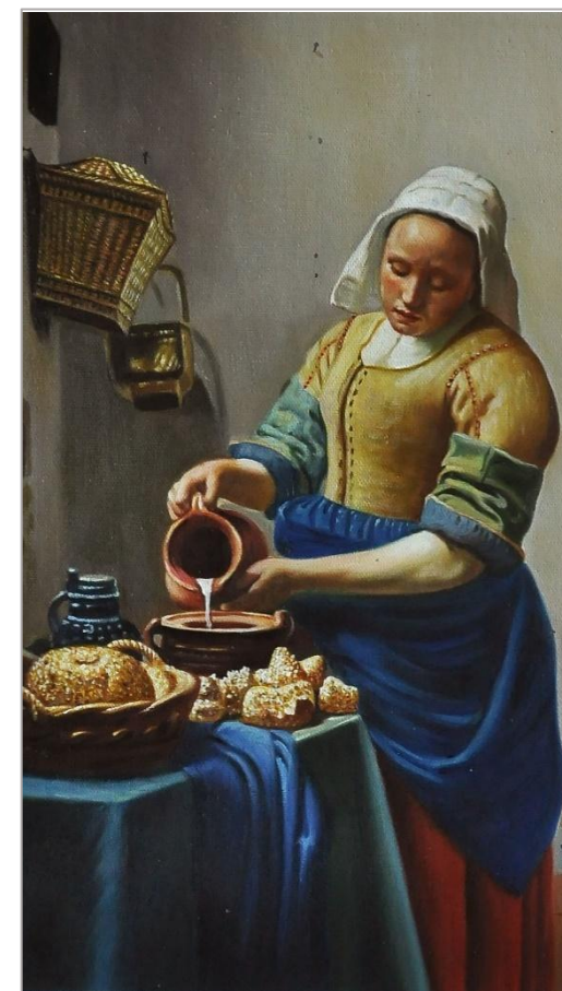
The Milkmaid, c.1660, Johannes Vermeer, Rijksmuseum, Amsterdam