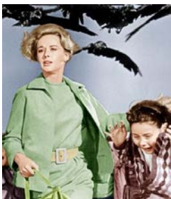
Tippi Hedren in Alfred Hitchcock's film The Birds (1963), based on the 1952 short story of the same name by Daphne du Maurier.

Venue & Time: Tuesday 23 September 2025, National Library of Australia, 6pm.