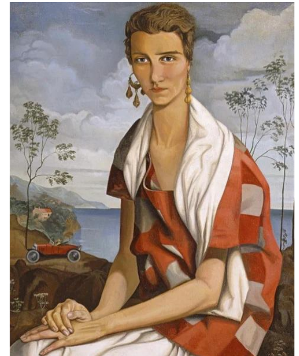
Alfred Courmes, Portrait of Peggy Guggenheim, 1926 Guggenheim Museum