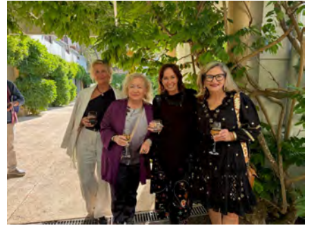
ArtsNational Margaret River launch at the Secret Garden, November 2025

It was with great excitement and anticipation that the newest ArtsNational society in Australia— ArtsNational Margaret River —offered its inaugural lecture on Tuesday 3 March .